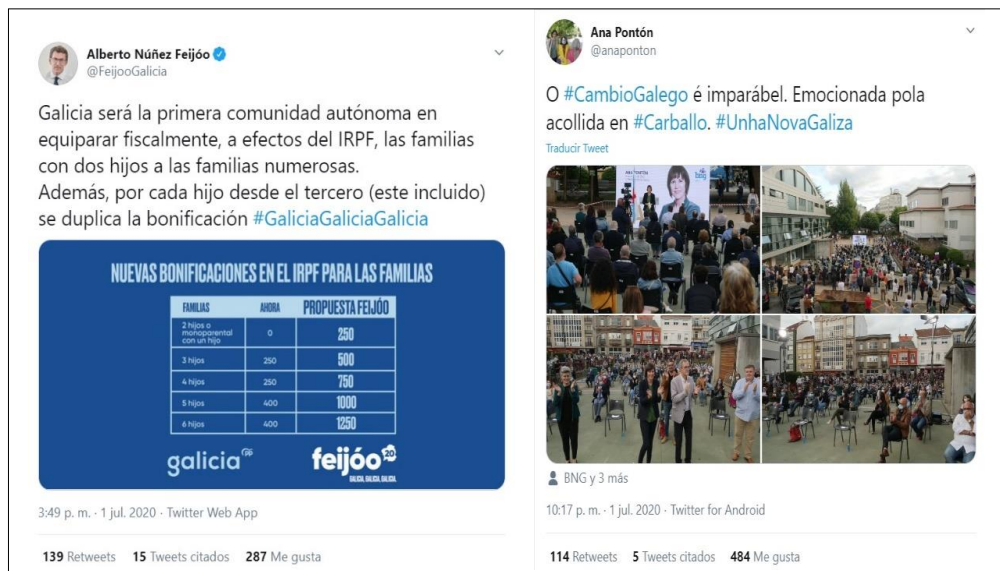
Image 1. Examples of tweets related to the economy (Feijóo) and political change (Pontón)