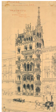
Image 1. First sketch of the “Can Roldós” building (Perspective of the facade, 1914)