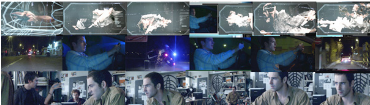
Figure 5. Rearrangement of the scene by visual patterns