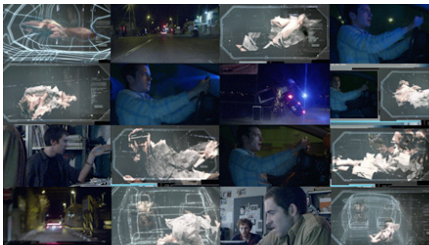
Figure 3. Car chase scene

the hackers to guide the actress so that she can escape, although Jill has an alternative plan in mind. When the sequence is displayed on the grid (Fig. 4), three distinct patterns or groups of thumbnails are clearly visible: in blue, the image of the protagonist driving the car at night, recorded with the webcam resting on the passenger seat. In green, the French group of hackers, from their usual shelter. And in red, in a simulated 3D image, the kidnapped actress inside the trunk of the kidnapper's car. The grid allows each space and character to be clearly differentiated and distinguished from one other by highlighting the visual style used in each representation. At the same time, the narrative progression of each space/character pairing can be easily traced. If we place each image, one after the other, selected by visual style patterns, we would obtain the succession of each of the sequences that take place in each camera of the multiscreen (Fig. 5). The grid functions, thus, as a tool for analysis that helps to perfectly reconstruct and trace the action that takes place in the parallel and abrupt montage within the film.