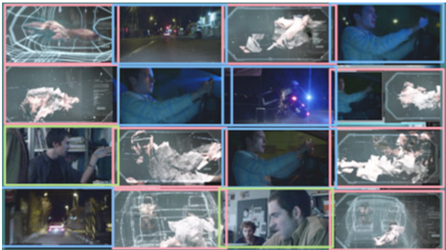
Figure 4. Patterns of the car chase scene