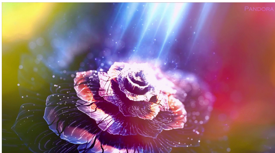
Figure 1. Image capture extracted from the GIF accompanying the nasheed analysed